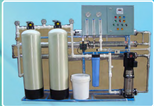
1 m 3 /hr RO Plant (Potable water) for Commercial Complex