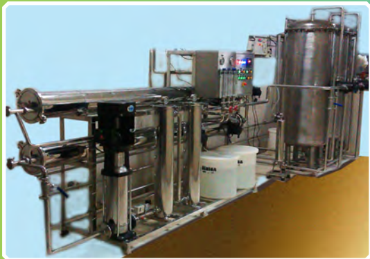
6 m 3 /hr RO Plant for Packaged Mineral Water Unit