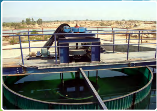
100 m 3 /hr Primary Clarifier (Pre-treatment) for Steel Industry