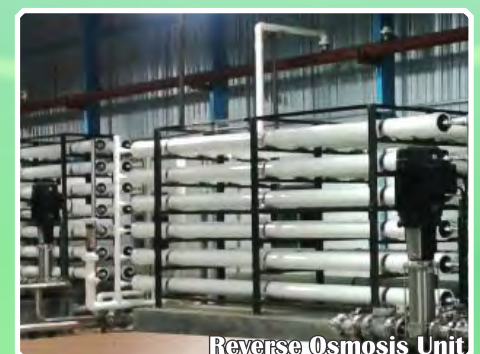
Reverse Osmosis Unit