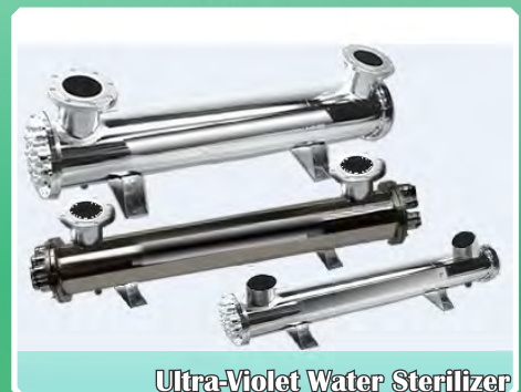
Ultra-Violet Water Sterilizer