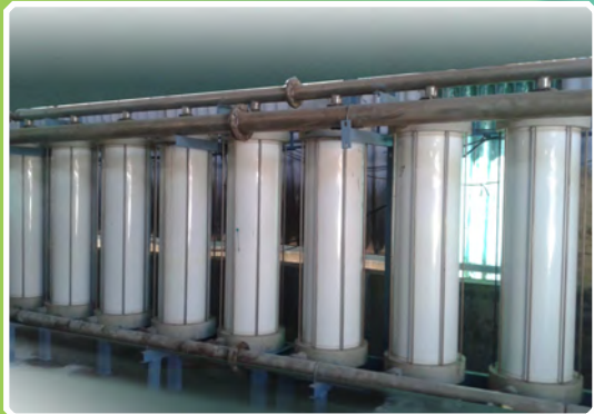
50 m 3 /hr Ultra-filtration for Textile Industry (ETP recycle-tertiary system)