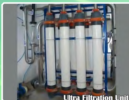
Ultra Filtration Unit