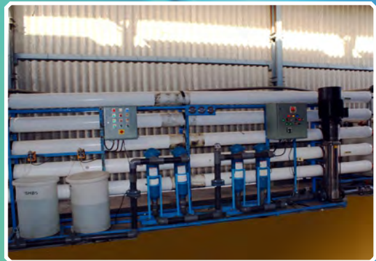
35 m 3 /hr RO Plant for Chemical Industry (ETP recycle-tertiary system)