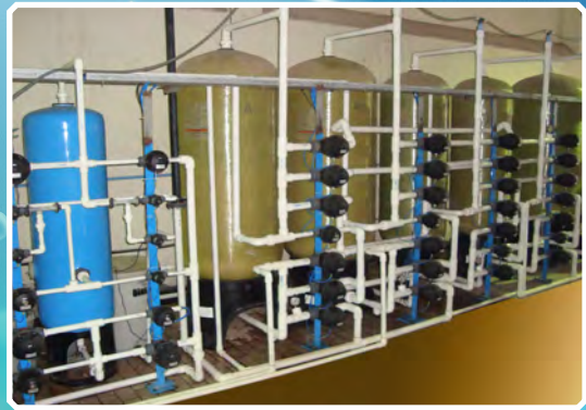
10 m 3 /hr Automatic DM Plant for Engineering Industry